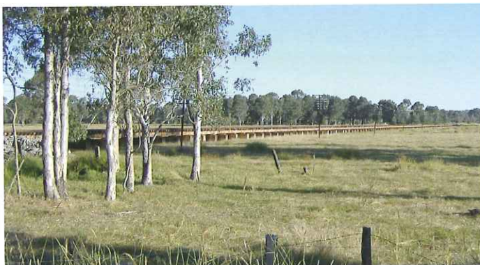
The original structure slowed traffic to just 40km