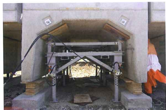
The unique purpose-built jacking system in action